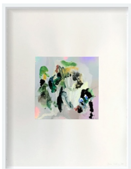
Mirror & stones V , 2016

oil, ink on iridescent mylar, mounted on paper