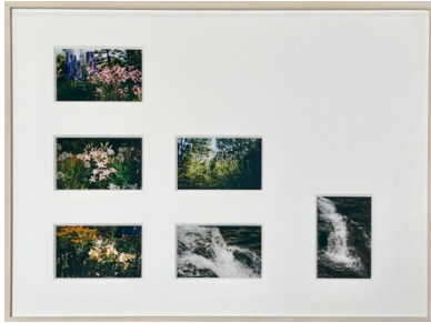
Thuya / Ithaca , 2020/2023 color photographs, window mat, wooden frame each: 4 x 6 in. (10 x 15 cm) frame: 21 5/8 x 27 7/8 x 1 1/2 in. (55 x 70,8 x 3,8 cm) $4,000