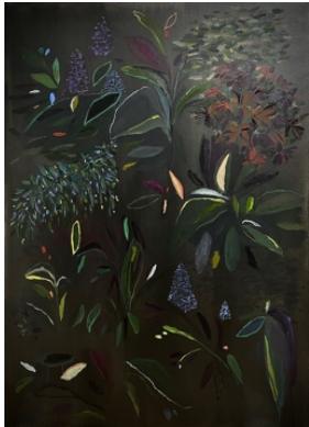
Nocturne VI , 2022

oil, ink, Japanese watercolor, pastel on canvas