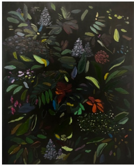
Nocturne XI , 2023