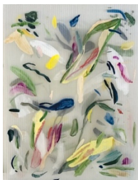
Treble II , 2022 oil, acrylic, aerosol on polycarbonate, two-way mirror 15 3/4 x 12 in. (40 x 30,5 cm) $3,000