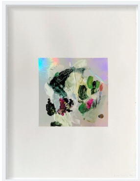
Mirror & stones VII , 2016 oil, ink, coin on iridescent mylar, mounted on paper 29 1/2 x 22 in. (75 x 56 cm) frame: 32 1/4 x 24 3/4 x 1 1/2 in. (82 x 63 x 3,8 cm) $4,000