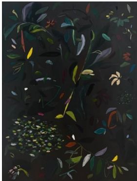
Nocturne VIII , 2023

oil, ink, Japanese watercolor, pastel on canvas