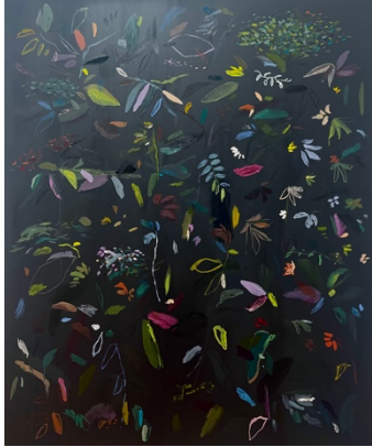
Nocturne X , 2023