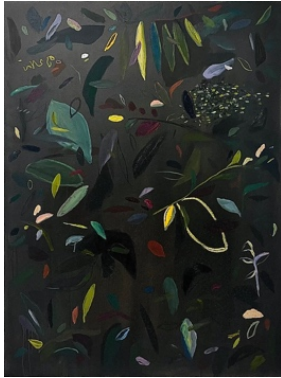
Nocturne IX , 2023

oil, ink, Japanese watercolor, pastel on canvas