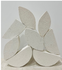
Leaves , 2023