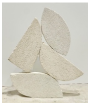
Phases , 2023